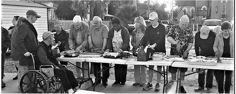
Women, children, and anyone in a wheelchair go to the front of the line.